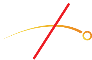
2. Do not isolate parts of the logo.