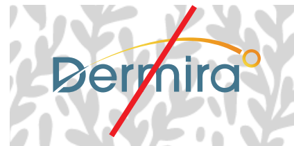
7. Do not place it on a complex, textured or patterned background that makes it difficult to see.