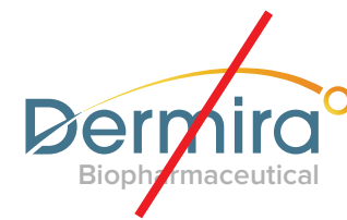
4. Do not attach text or graphics to create a new logo.