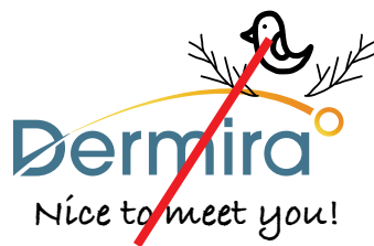
5. Do not crowd the it with content.